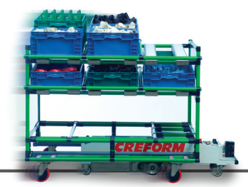
Creform line-side gravity flow racks are easily sized to specific needs.